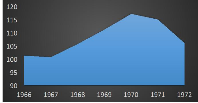
Figure 2. Foreign assets and the monetary base

In the graph, net foreign assets is the sum of gold reserves, foreign securities, compensation received under the Sterling Guarantee Act, and interest due but not received (which was overwhelmingly interest deriving from foreign assets). Since there were no foreign liabilities, net foreign assets were equal to gross foreign assets.