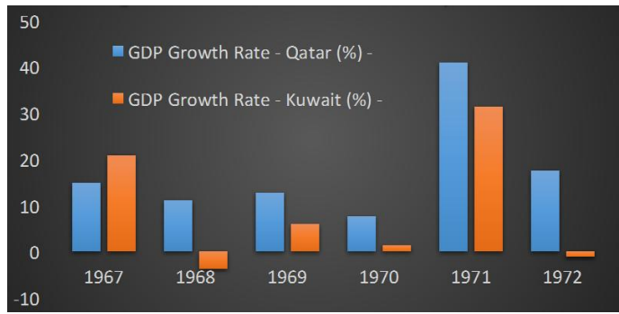
Figure 6. GDP growth rate comparison

board was active, except in 1967, suggesting at the very least that the currency board was not a hindrance to growth.