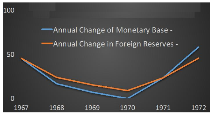
Figure 4. Annual change in monetary base and foreign reserves

Figure 3shows that that the reserve pass-through ratio fluctuatedgreatly during the Qatar-Dubai Currency Board's life. When we ran tests 1 and 2, the Board proved to be orthodox; Figure 3 suggests that it was not. However, it is important to understand that especially for small currency boards such as that of Qatar and Dubai during 1966-1973, minor fluctuations in the market value or market cost of securities, or the timing of expenditures and receipts, can strongly affect the reserve pass-through ratio. Therefore, to further test the orthodoxy of the board we analyzed the monetary base and foreign assets in a different way, by comparing the annual change in monetary base to that in the foreign reserves.