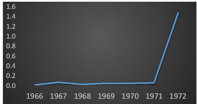
Figure 1. Domestic Assets

For a currency board to be considered orthodox, it is imperative that the percentage value of its domestic assets as a share of total assets should be close to zero. Usually, a small amount of domestic assets is held by the board in order to pay for staff salaries, etc., but that is all.