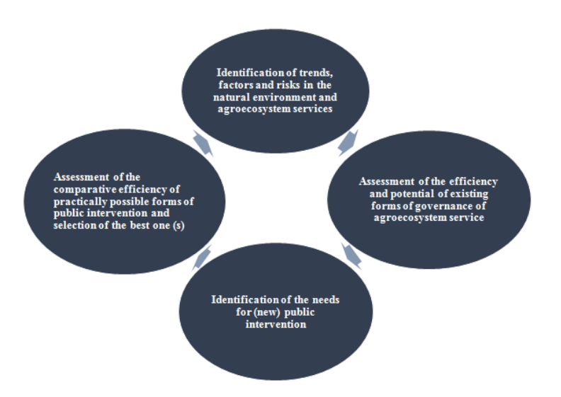
Figure 5. Stages in the Analysis and Amprovement of the System of Governance of Agroecosystem services

- climate change, degradation and destruction of natural resources and ecosystems, eco-risks, etc. (MEA). Moreover, it offers reliable tools for assessing the (positive and negative) impact of agriculture on the ("health") state of nature, its main components, and ecosystem services of various types, including at different spatial and temporal scales. For example, systems of multiple eco-indicators for pressure, state, response, and impact, volume and structure of ecosystem services, integrated assessment of agroecosystem services, eco-sustainability of agriculture, etc. are widely applied. The absence of serious eco-problems, conflicts and risks is an indicator that an effective system for governance of agro-ecosystem services exists. In most cases, however, significant or increasing eco-problems and risks related to agricultural development are observed, as is the case with Bulgaria (MAOC).